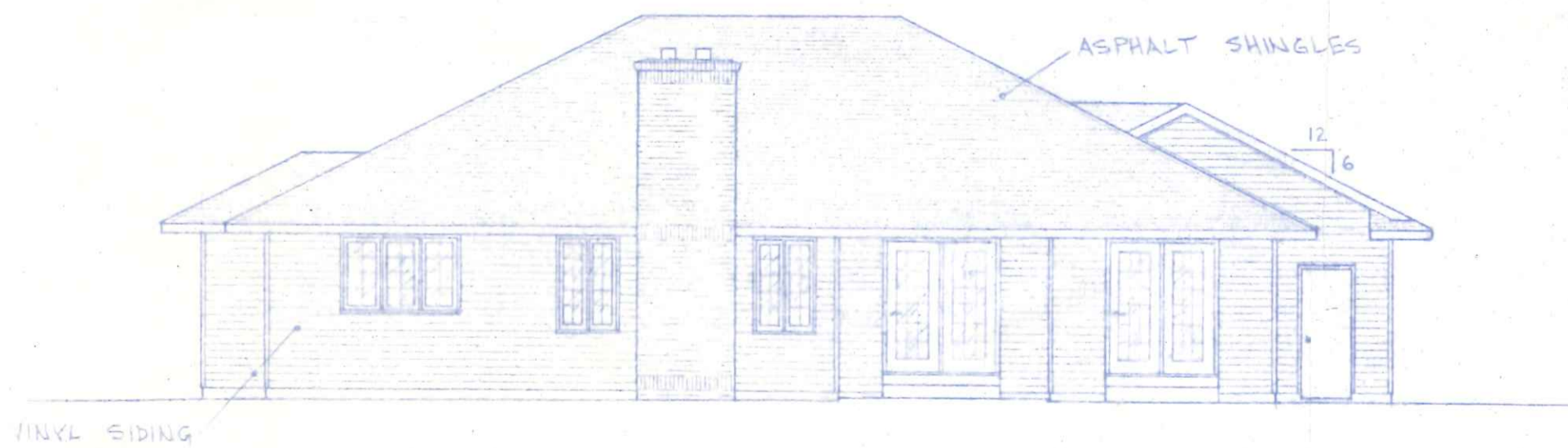
REAR ELEVATION 1/8" = 1'-0"