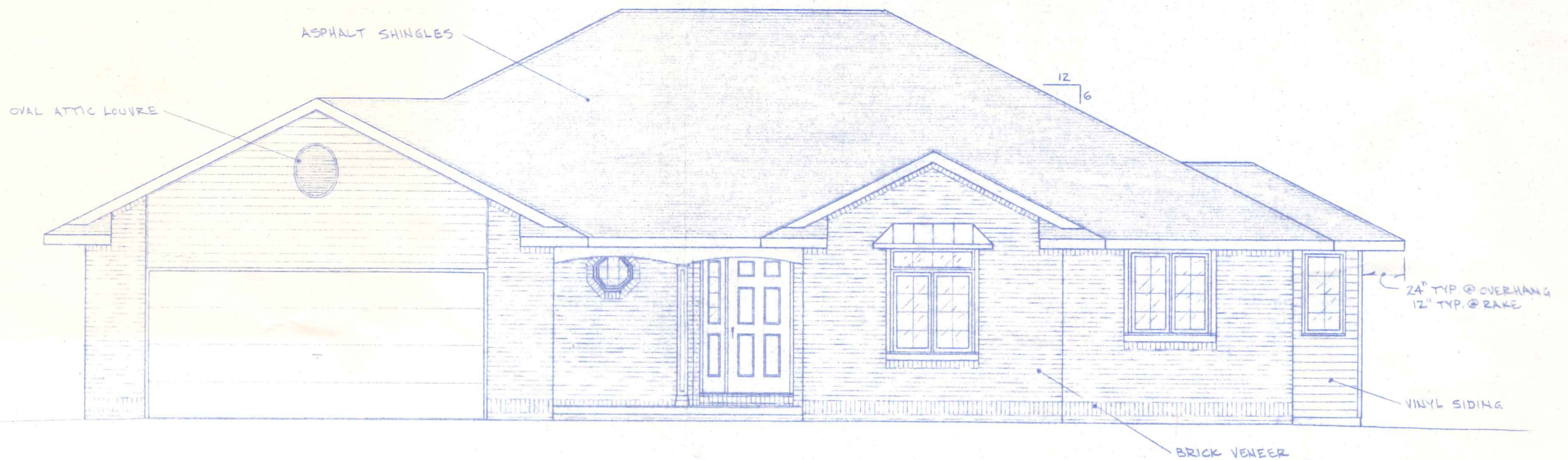
FRONT ELEVATION 1/4" = 1'-0"